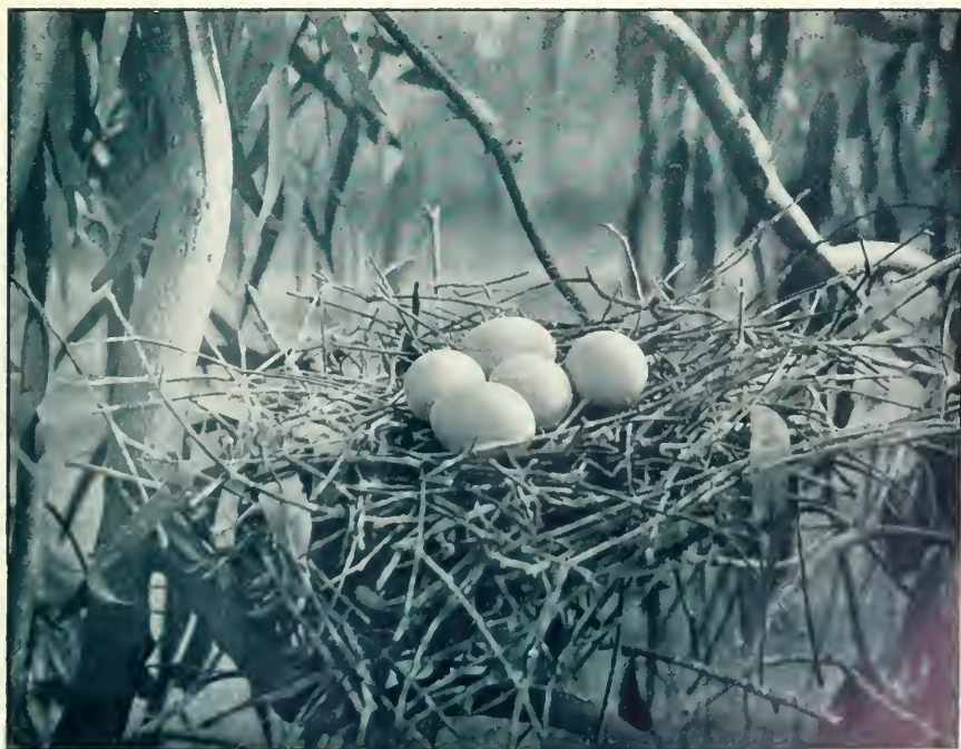
Nests of White-fronted Heron ( Notophoxyx nove-hollandic ).

(1.) With young and egg just chipped. (2.) With eggs.