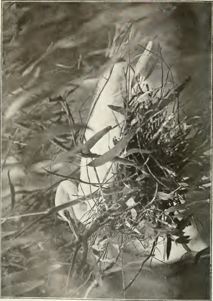
Brooding Plummed Egret ( Mesophoyx plumifera ).