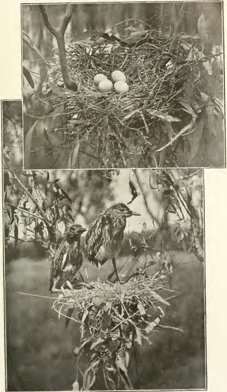
Nests of Night-Heron ( Nycticorax caledonicus ), Eggs, and Young.