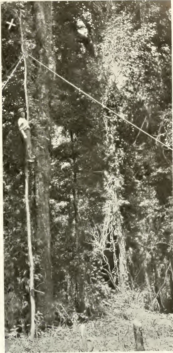
Wm. M'Enery ascending pole to Nest (see ×) containing first found complete clutch of Rifle-Bird's Eggs. Locality—Booyong Scrubs, Richmond River, N.S.W.