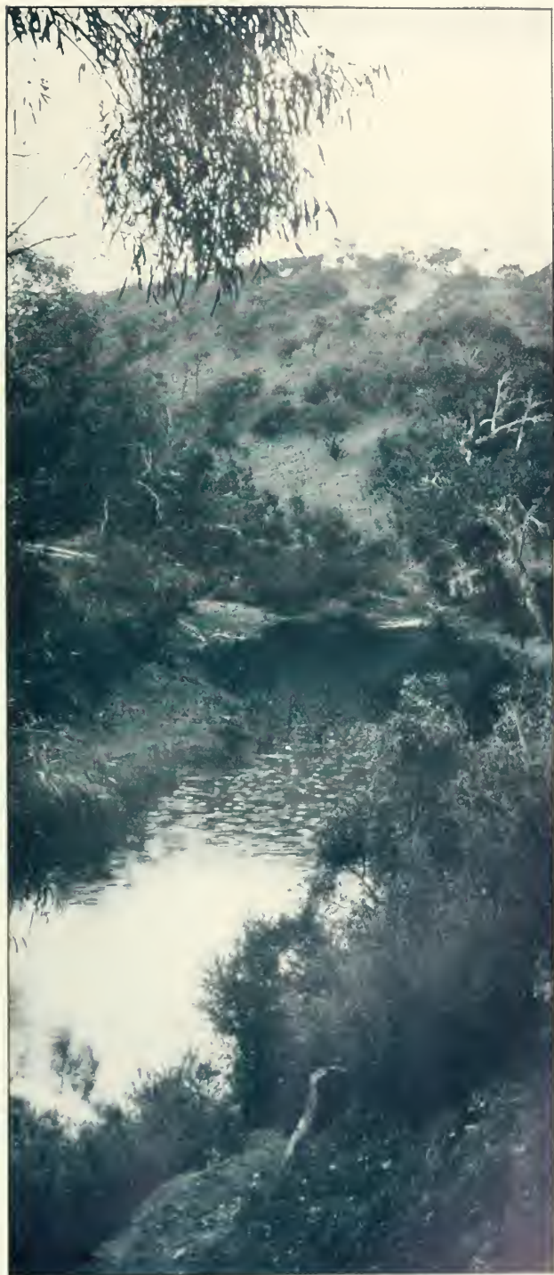
Pool on Jackson's Creek, near Redstone Hill.

(The vegetation of the creek side is chiefly Leptospermum (tea-tree) and Hymenanthera (tree-violet), but Eucalypti (gun-trees) are characteristic of the hill slopes. A branchlet of their vertically hanging leaves is seen in the top of the picture.)