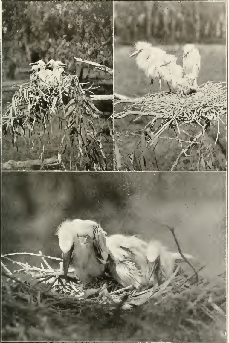
Starveling Egrets (Parents Shot for their Plumes). Young ( plumifera ) Calling to Passing Herons for Food. Waiting for the End. Young ( timoriensis ) All But Dead.