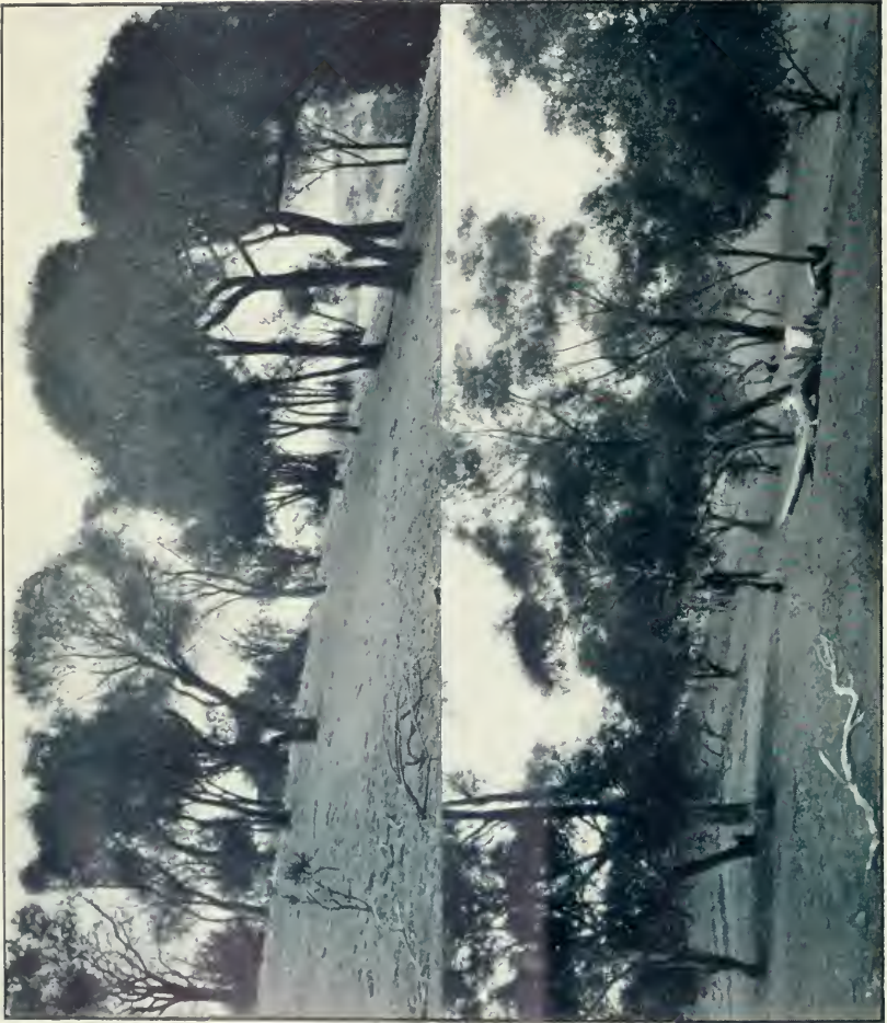
(1.) Belt of Sheoaks ( Castarina ). (2.) Clump of Box ( Eucalyptus ).