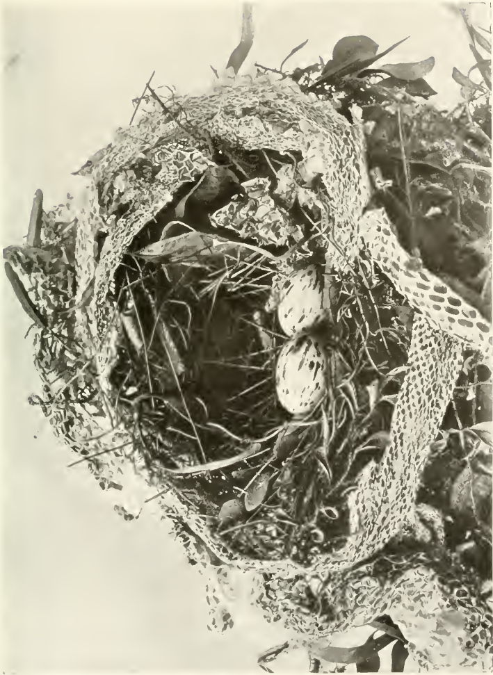
Nest and Eggs of the Rifle-Bird ( Ptilorhis paradisea ). (First found with complete clutch. Nearly half natural size).