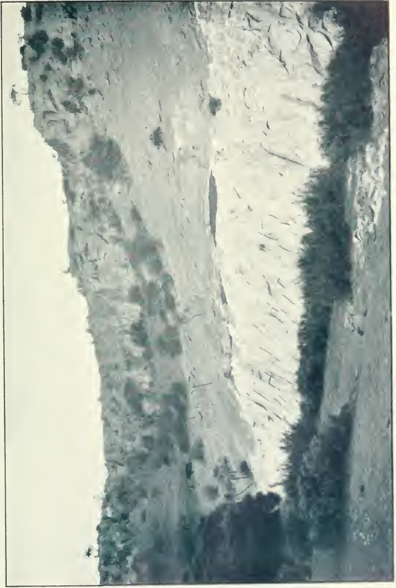
Eagle Rocks. (The crags in the upper part, where the Eagles nested, are basalt (lava) rock. As a deep flow this overlies Silurian gold-bearing sandstone, now exposed by the action of the creek.)