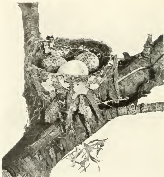
Nest and Eggs of Brown Flycatcher ( Micræca fascinans ), with Egg of Square-tailed Cuckoo ( Cacomantis variolosus ). (Nearly natural size.)