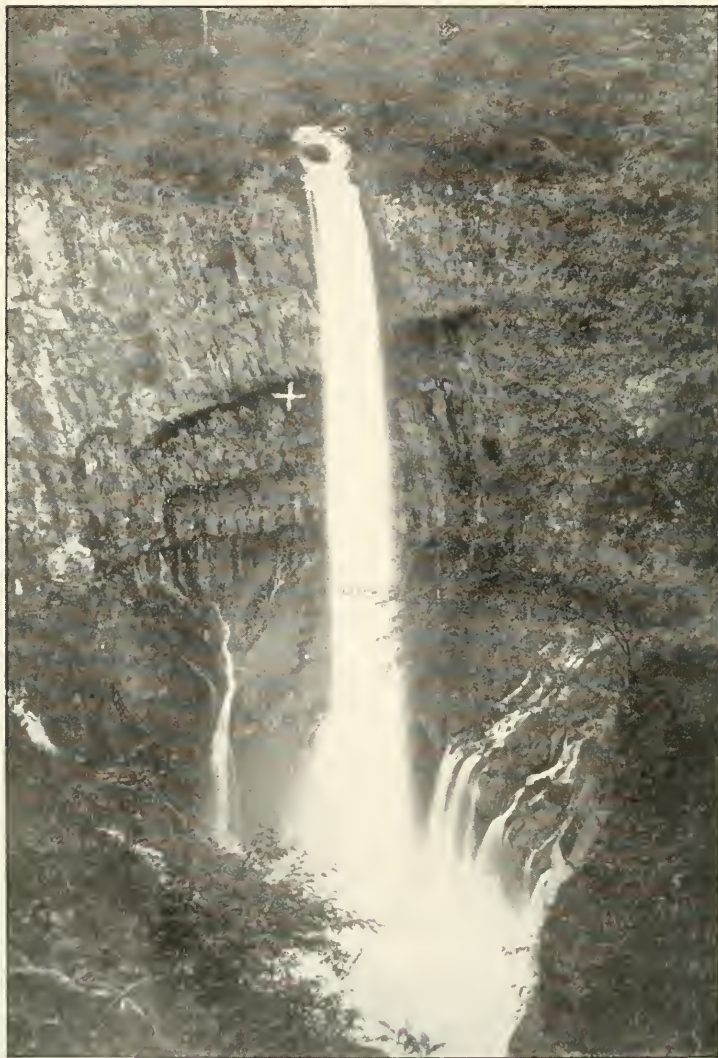
Kegon Waterfall, Japan.

White Cross Showing Site of Spine-tailed Swifts' ( Chaturax caudata ) Nests.