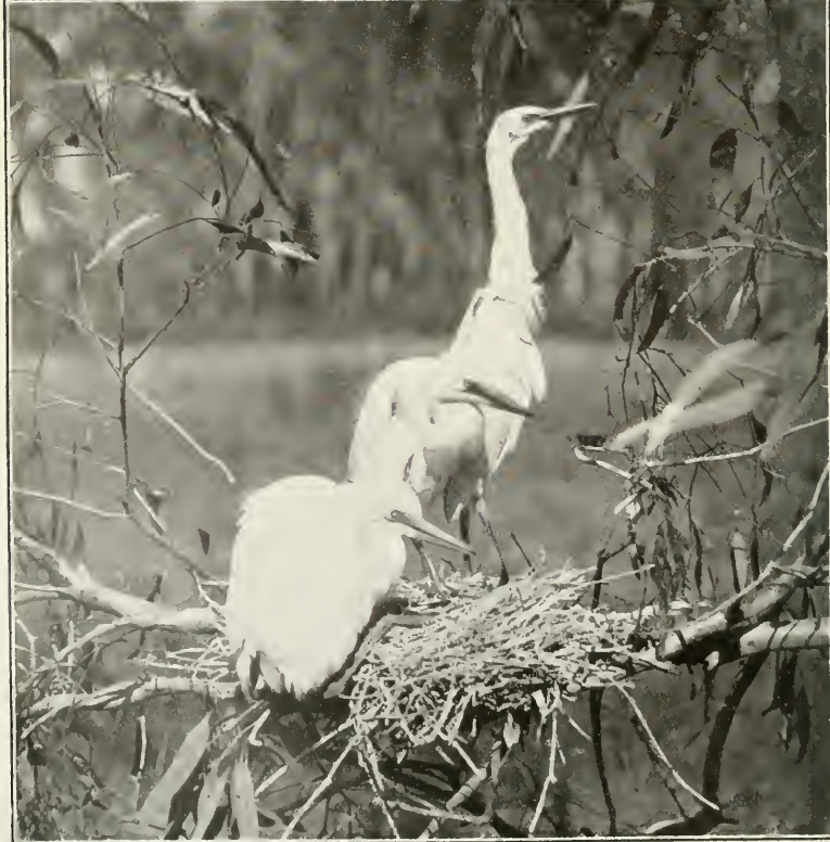
Young Egrets ( Mesophoyx plumifera and Herodias timoriensis ).