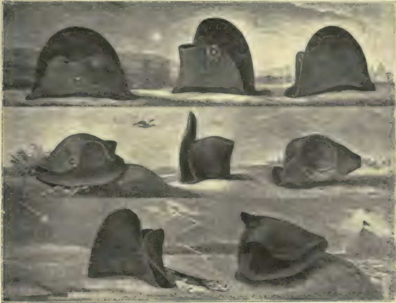
THE EIGHT EPOCHS OF THE LIFE OF NAPOLEON.

Napoleon's career between the years 1803 and 1814, when it was "shaped most freely by his own will," was an unparalleled