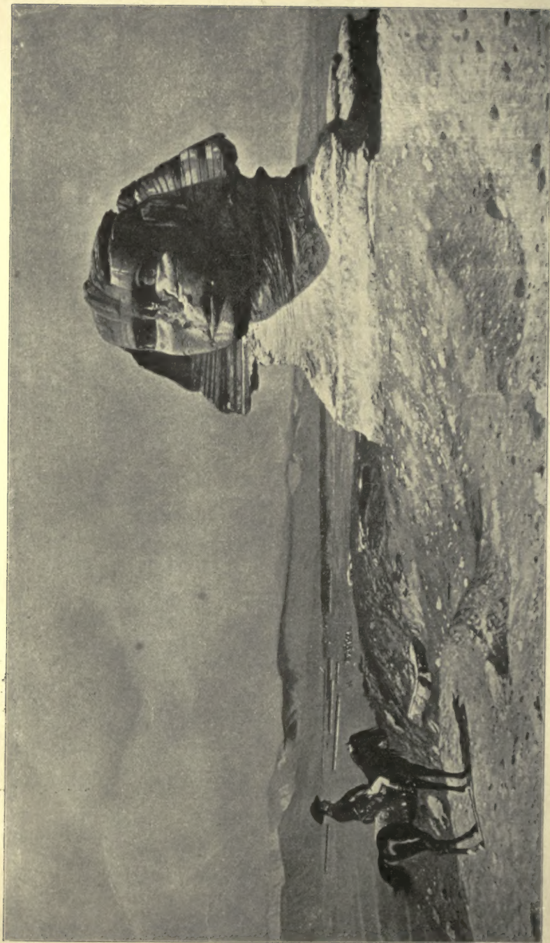
NAPOLÉON BEFORE THE SPHINX. (By J. L. Gérôme.)