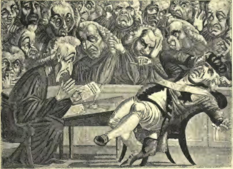
CARICATURE OF GEORGE III. AND HIS COUNCIL RECEIVING THE NEWS OF NAPOLEON'S CAPTURE OF MADRID.

suggested Egypt, to the Directory, as the scene of future conflict and glory for the French arms, the legislative figureheads of France were not slow in taking the hint. They felt themselves insecure in their imitation curule chairs as long as the idol of the people and the army remained inactive at home. The excuse for the expedition was this: To strike a blow at the English in the East, and cut them off from communication with India. It was an extravagant idea altogether, this sending a French army