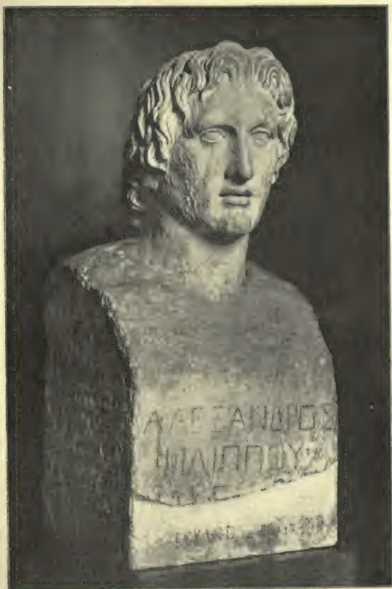
ALEXANDER THE GREAT. (Musée du Louvre, Paris.)