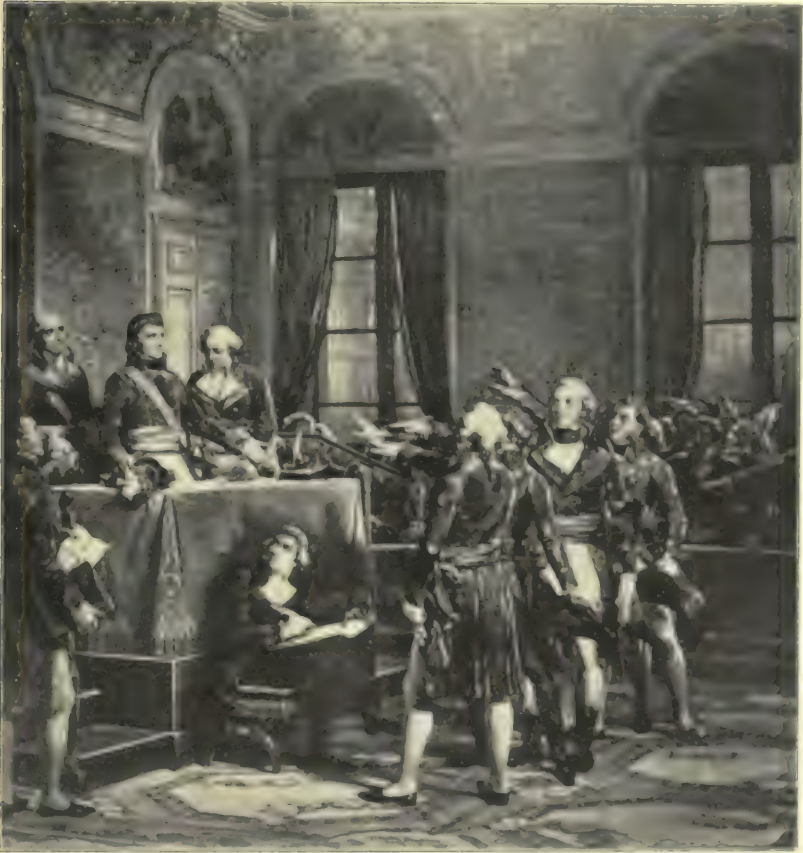
INSTALLATION OF THE COUNCIL OF STATE.

ders of the sun Napoleon, each of them commanding a division of the innumerable army of the stars, which is called the celestial host in the Bible, and is divided into twelve parts, corresponding to the twelve signs of the zodiac. Such are the twelve marshals who, according to our mythical chronicles, were actively em-