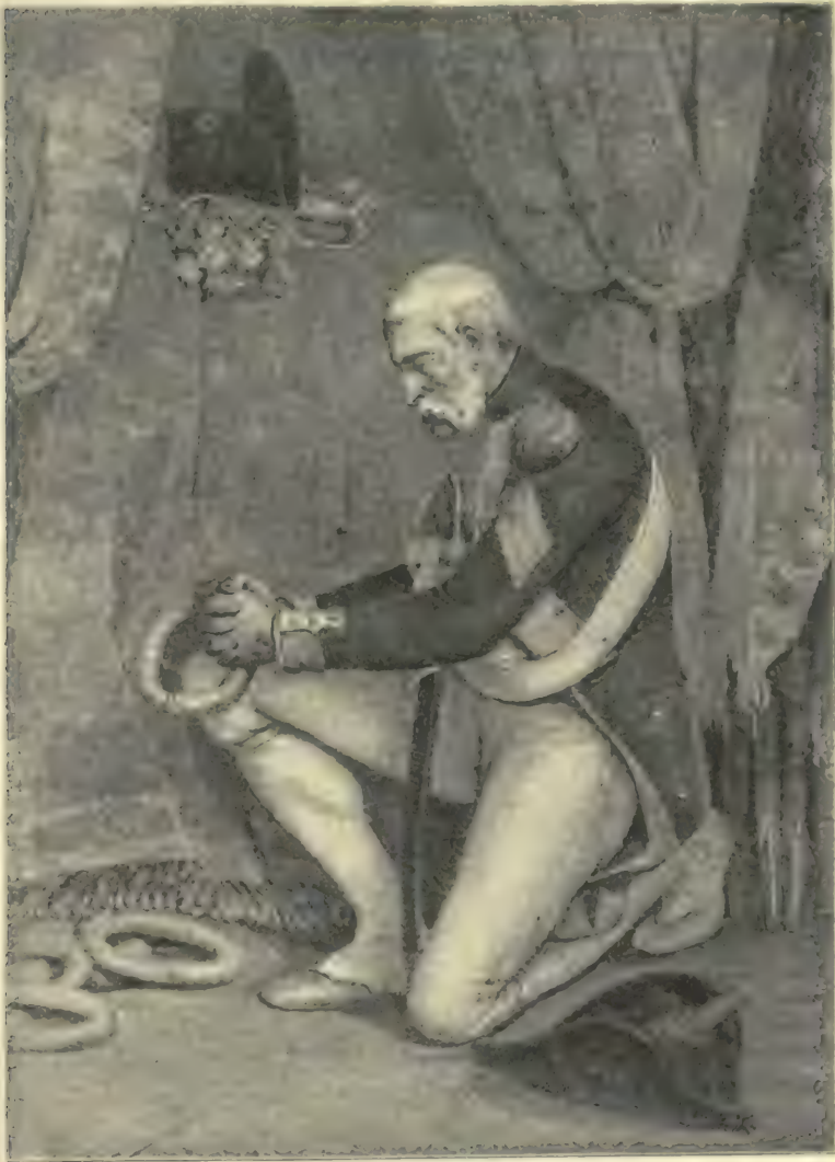
OLD SOLDIER'S PRAYER ON THE 5TH OF MAY. (After a Litho. by de Charlet.)

at last been decided to place the famous black felt head-dress in the central room of the museum beside the flag of Rocroy.