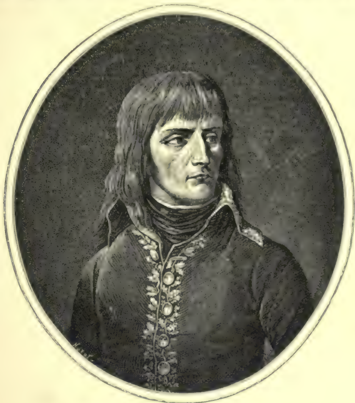
GENERAL BONAPARTE

3. His mother is said to have been named Letitia. But by the word Letitia (or "joy") was meant the dawn whose first tender light fills all nature with joy. It is the dawn, say the