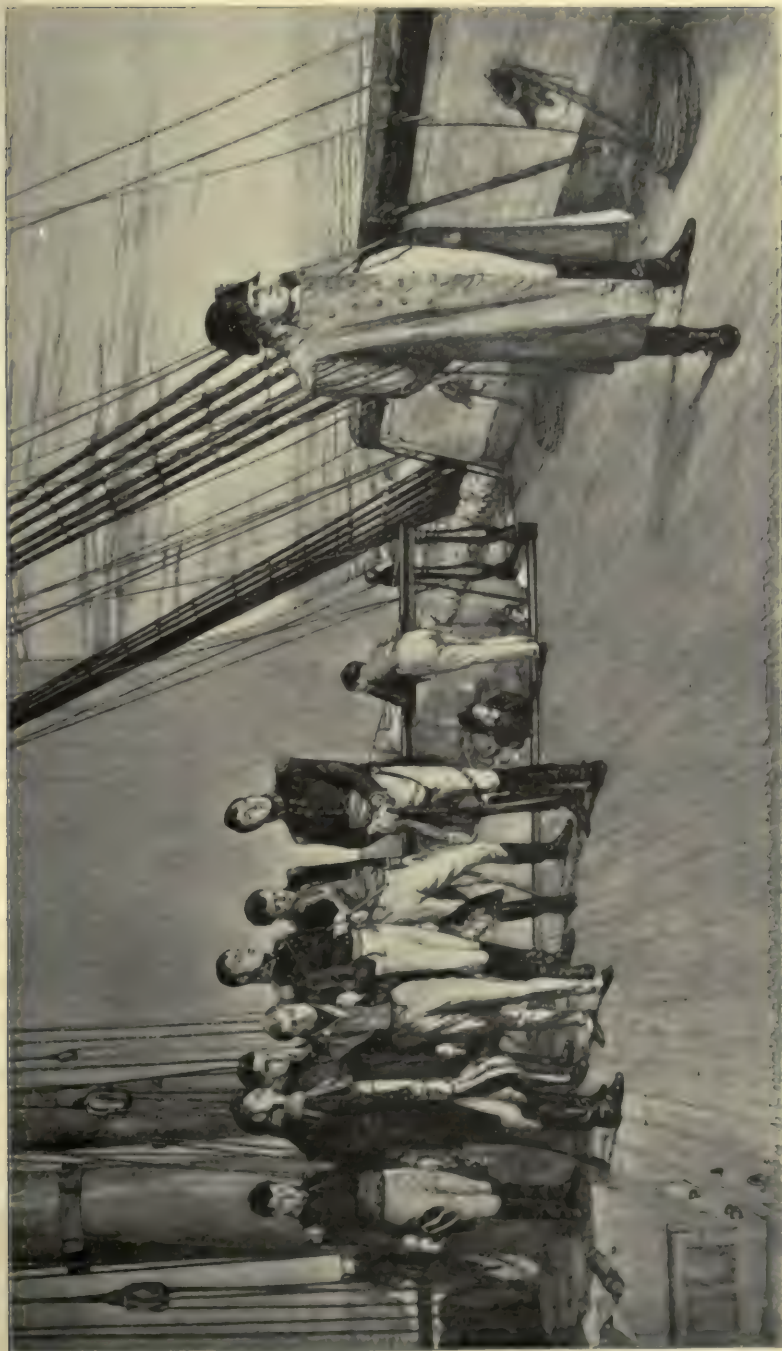
NAPOLEON ON H. M. S. BELLEROPHON. July 23, 1815.