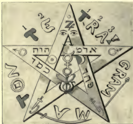
FIGURE OF THE PENTAGRAM

* De la Haute Magie , vol. II., pp. 55-62. "The pentagram," says Lévi, "is called in the Gnostic schools the Blazing Star, and is the sign of Intellectual Omnipotence and Autocracy. It is the Star of the Magi; it is the sign of the Word made Flesh, and, according to the direction of its rays, this absolute symbol represents Good or Evil, Order or Disorder, the blessed Lamb of Ormuzd (Ahurô-Mazdaô), and St. John, or the accursed Goat of Mendes."