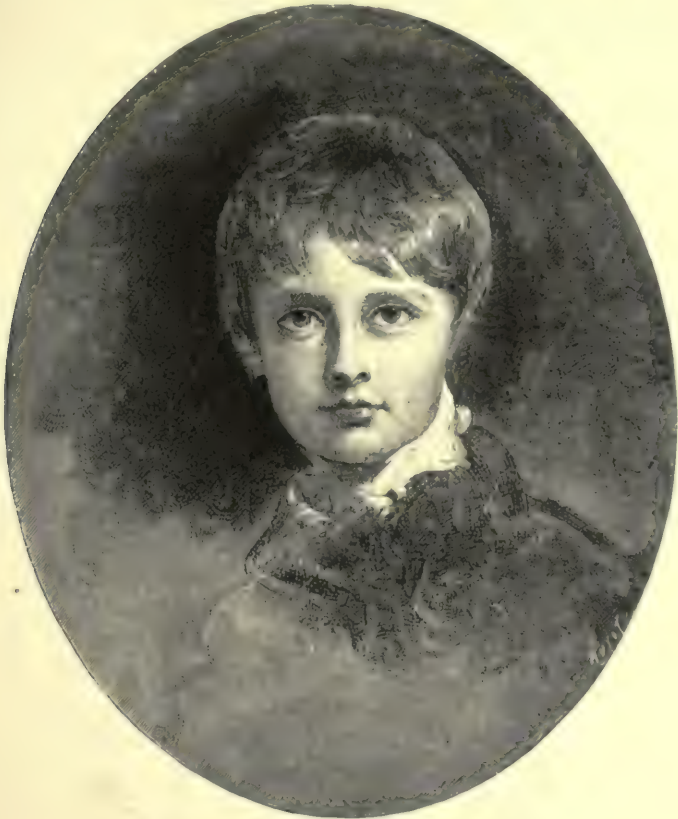
THE KING OF ROME. (After Lawrence.)

Napoleon took with him, as is well known, a number of learned and brilliant savants, whose knowledge of Egyptian antiquities, hieroglyphics, and the like was profound. These archæologists went for the ostensible purpose of studying the monuments and relics of the land, in order to report upon the same for the benefit