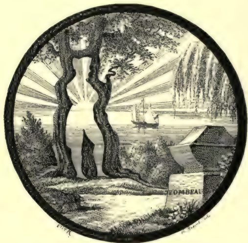
TOMB AT ST. HELENA. SILHOUETTE OF NAPOLEON AMONG THE TREES.

The body of Napoleon was finally laid away in a massive sarcophagus of the black marble of Egypt. It lies beneath the great gilded dome of the Invalides, which has been compared by Hugo to a giant helmet, fit covering for the First Captain of the Age.