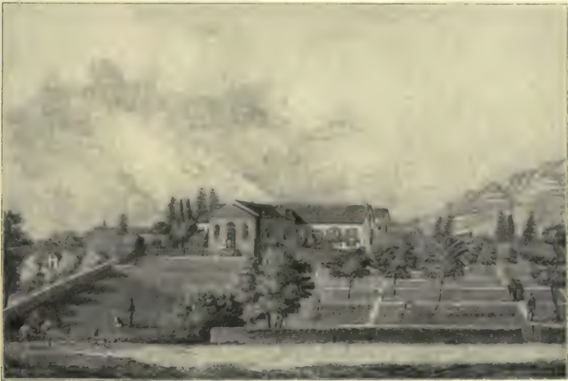
VIEW OF LONGWOOD, ST. HELENA.

“The whole revolutionary work of modern times was symbolically summed up by the Napoleonic substitution of the Star of Honor for the Cross of St. Louis. It was the Pentagram substituted for the Labarum, the reinstatement of the symbol of light, the Masonic resurrection of Adon-hiram. It is said that Napoleon believed in his star ; and that if he could have been persuaded to say what he understood by this star it would have been found that it was his own genius; and therefore he was in the right to