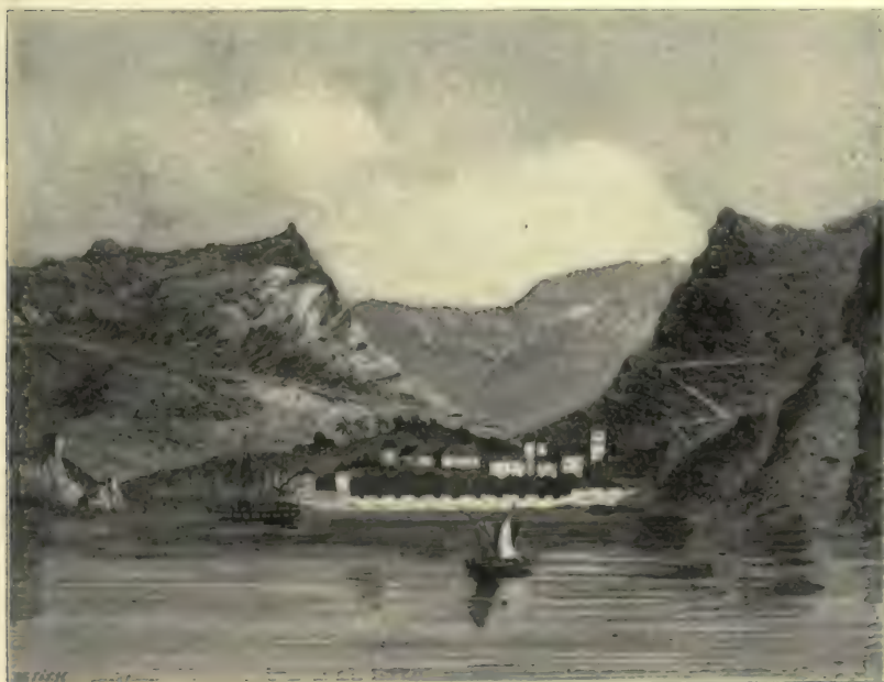
JAMESTOWN, ST. HELENA

paign of the Hundred Days, were "declared to be incapacitated to receive any title or form any part of the new army about to be organised. The superior officers were dragged before military commissioners." Ney, who led the last charge of the Guard, was shot. Many of the officers fled to foreign lands. Some of them came to Texas, and endeavored to form a settlement there, but