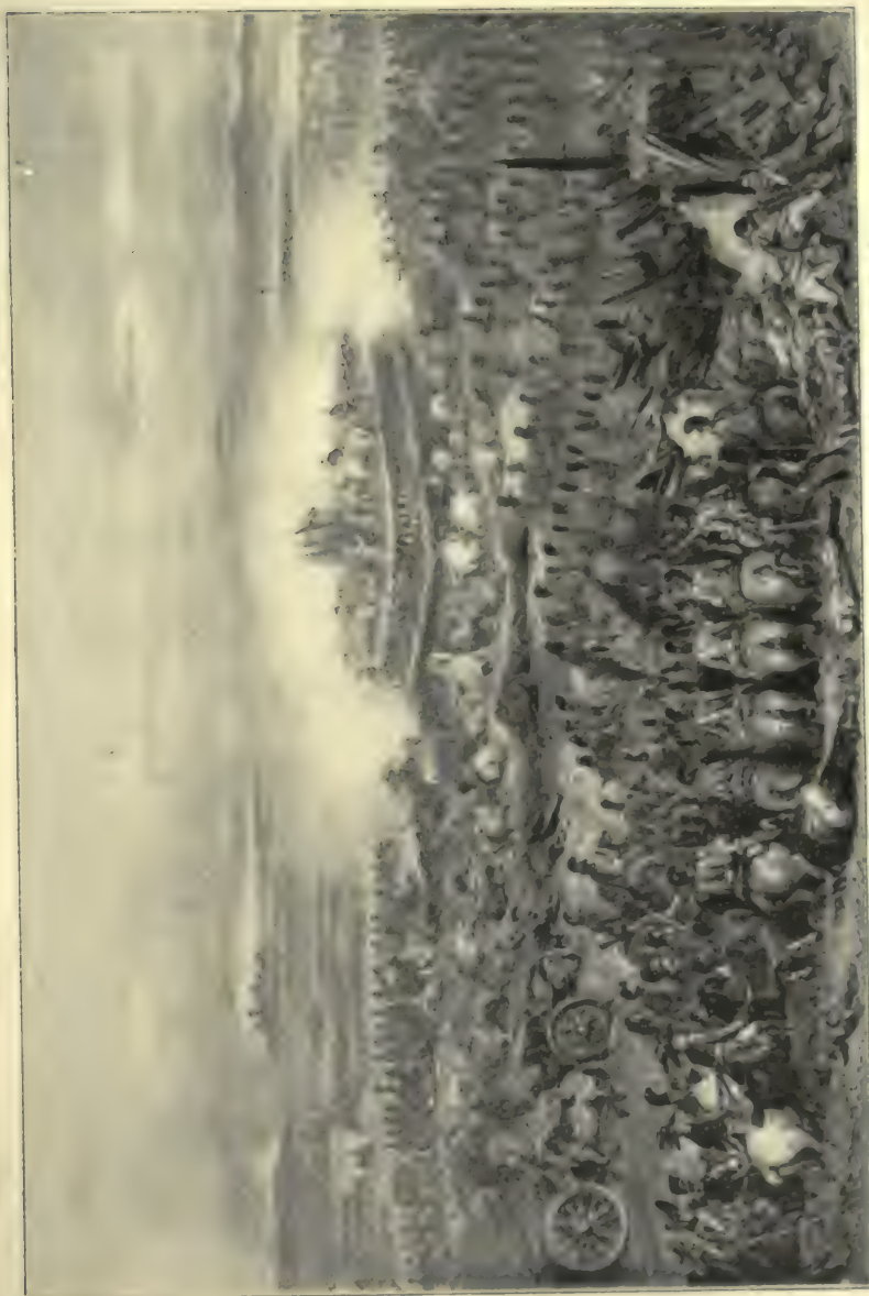
RETREAT OF THE SACRED BATTALION AT WATERLOO (After Raffet)