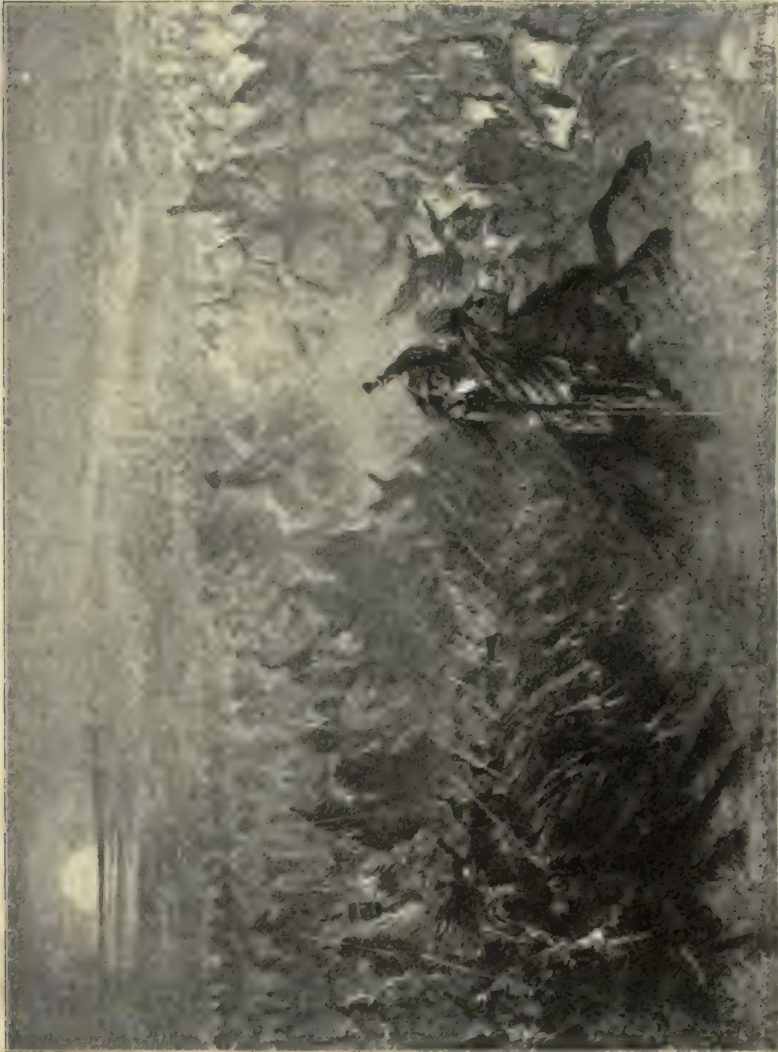
LA REVUE NOCTURNE (After Raffet)

Hugo's description of the Cuirassier charge: "At a distance it appeared as if two immense steel snakes were crawling toward the crest of the plateau; they traversed the battlefield like a flash.