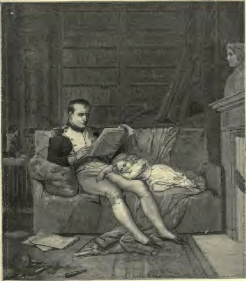
NAPOLEON AND HIS SON.

campaigns of Alexander, and wrote to Tippoo-Saib that he was preparing to 'deliver him from the iron yoke of England.' At another time, he pictured himself as raising an insurrection of the Druses and Greek Christians against the Turks, and marching