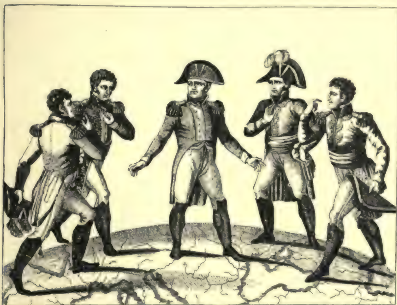
DIVIDING THE WORLD AMONG HIS BROTHERS

"As to Napoleon the man, a flood of contemporary witnesses like De Rémusat, Pasquier, Chaptal, etc., bear witness to his