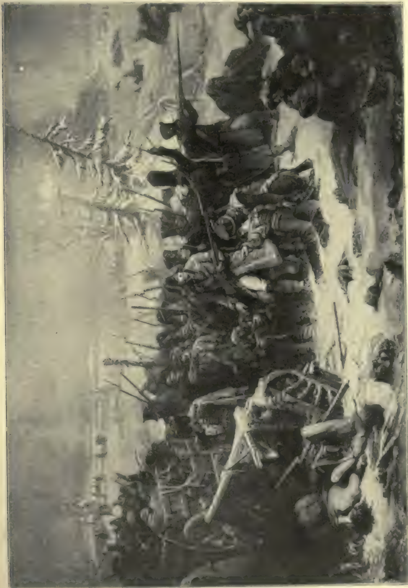
RETREAT FROM MOSCOW MARSHAL NEY ENCOURAGING THE REAR GUARD. (Painted by Yvon) Museum of Versailles

The matter was carried so far that several subalterns and soldiers proceeded to the shore, and some of them went on board the mer-