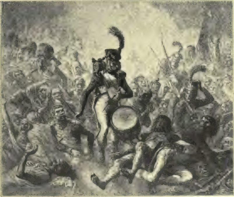
REVEILLE OF THE DEAD. (After Raffet.)

Everything connected with Napoleon is theatrical, his coronation, his death, his second funeral. While he was dying, a terrific thunderstorm was raging at St. Helena. It seems as if nature had conspired to make the death of the Cæsar heroic. Amid