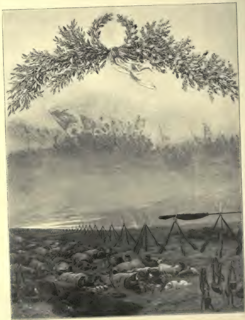
THE SOLDIER'S DREAM. (Detaille.)