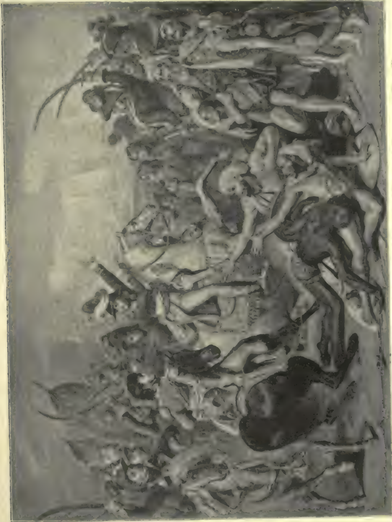
NAPOLEON AT THE BATTLE OF THE PYRAMIDS. (By Gros.) Muscum at Versailles

Thus the pretended Prince of Canino is nothing more than the personification of winter. Winter begins when nothing more is left of the three good seasons, and the sun is at his greatest dis-