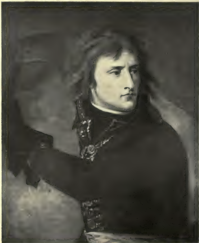
NAPOLEON ON THE BRIDGE OF ARCOLE. (After the oil-painting of Baron Gros.)